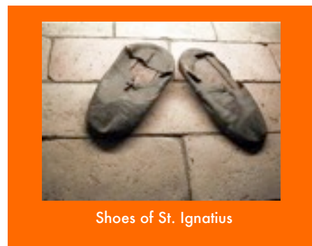
Shoes of St. Ignatius

Gratitude to all those who have gone before us and encourage us on the way.